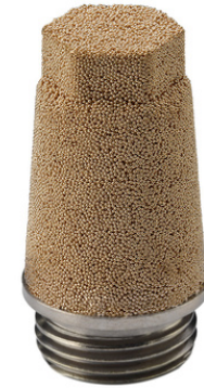
Livello di rumore / noise level dB 6 BAR