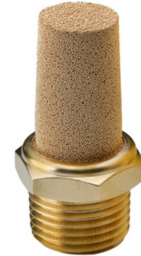
Livello di rumore / noise level dB 6 BAR