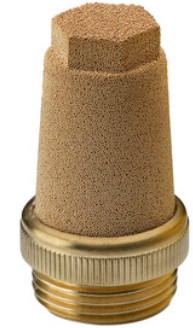
Livello di rumore / noise level dB 6 BAR