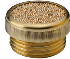
Livello di rumore / noise level dB 6 BAR